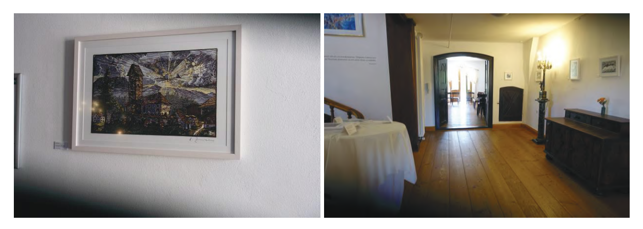
The exhibition of the woodcuts were in the stair floor of the castle.

In the castle of Hopferau, there are many paintings by Konrad Zuse.