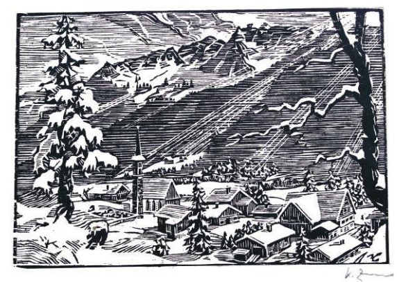
I finished a booklet with the woodcuts – about 23 – which Konrad Zuse created in Hinterstein and Hopferau from 1945-49.